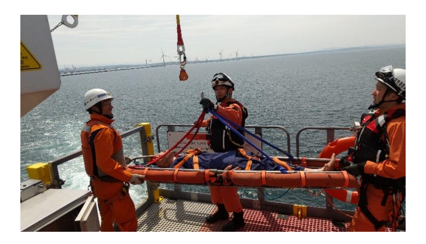
(Photo) Hanging a stretcher on crane at the offshore installation site